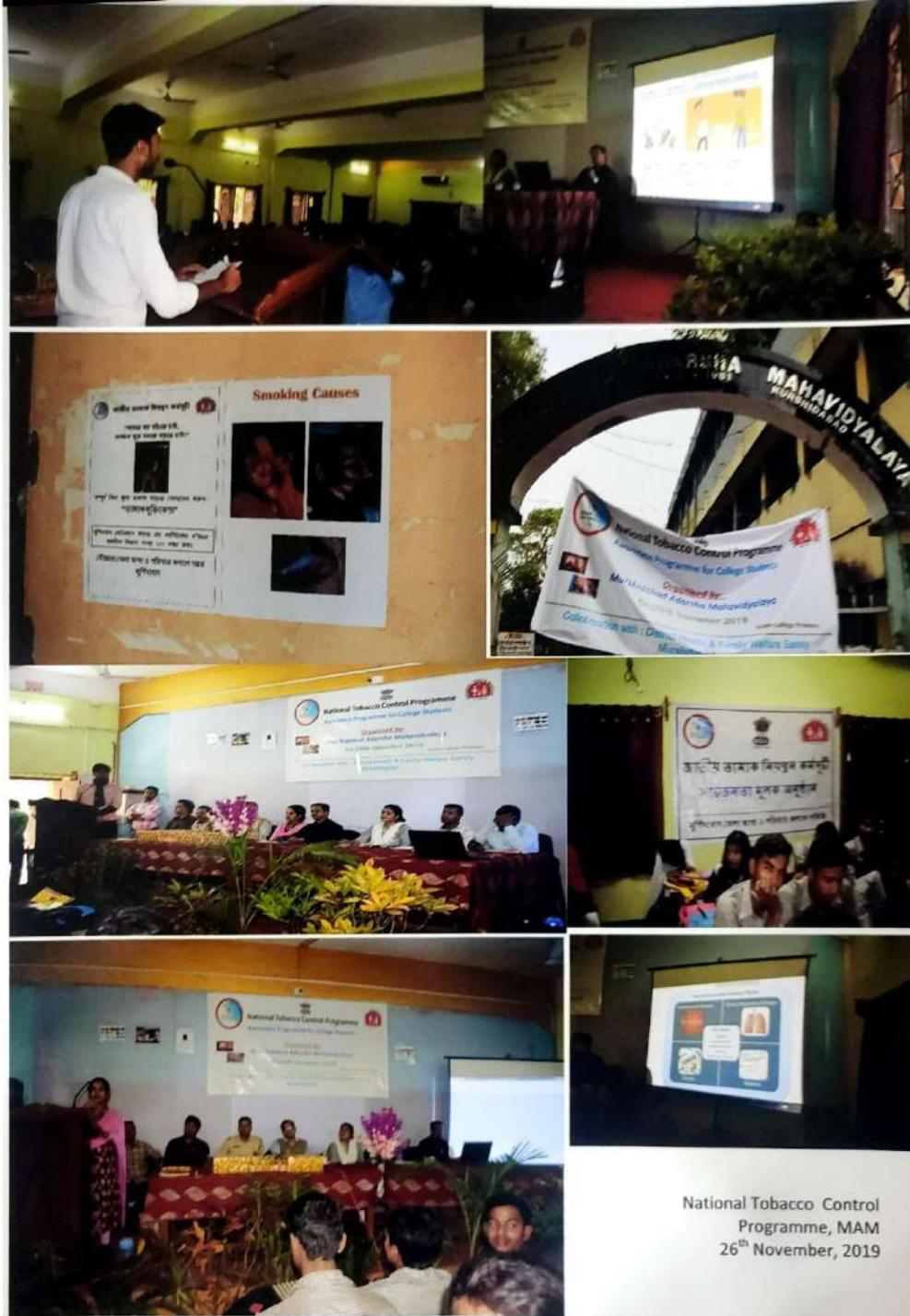
National Tobacco Control Programme, MAM 26 th November, 2019